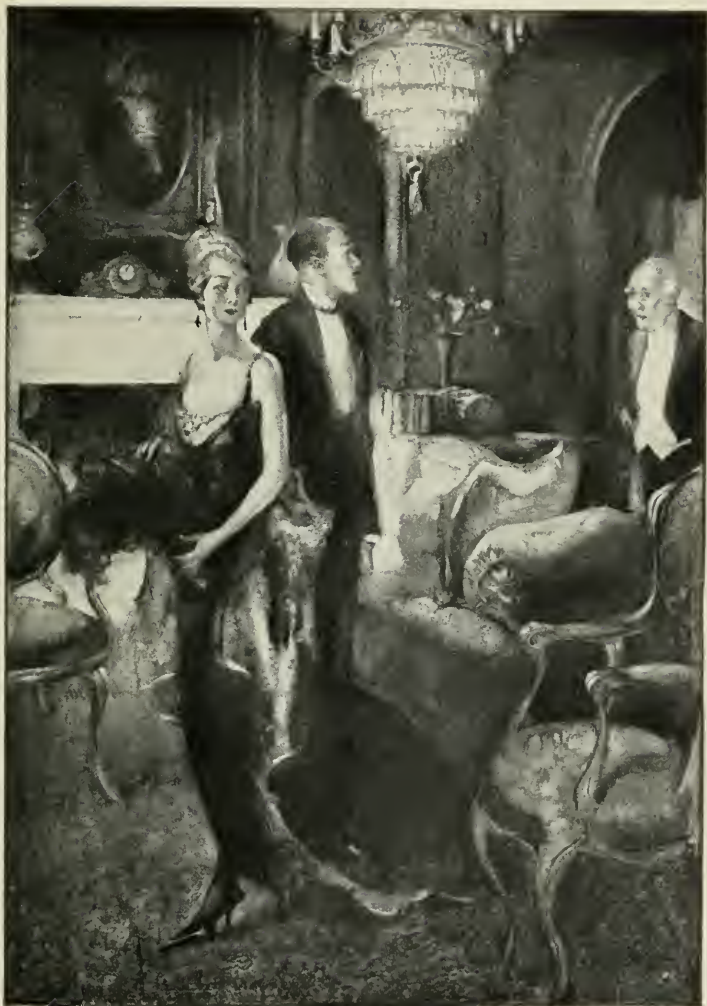
He swung around to find Seaman standing upon the threshold. Page 182.